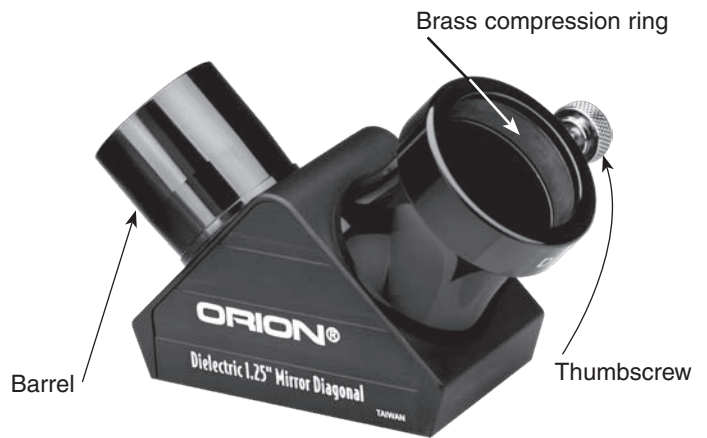
The Orion 1.25" High Reflectivity Mirror Star Diagonal

The 2" star diagonal will accept either 2" or 1.25" eyepieces using the supplied 1.25" eyepiece adapter. If using 2" eyepieces, remove the 1.25" adapter from the diagonal.