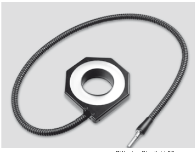
Diffusing Ringlight 66 mm