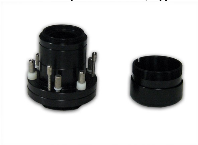
Secondary holder and HyperStar lens